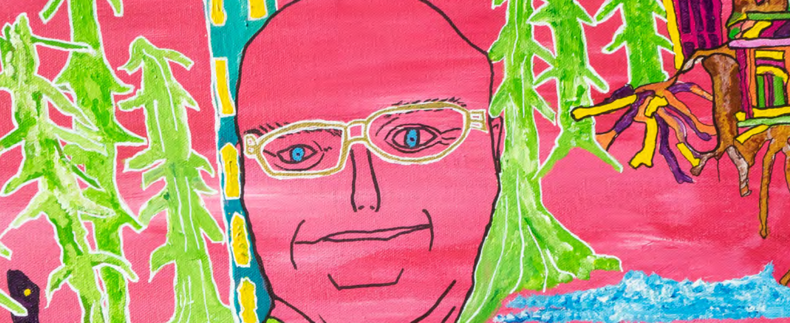
Artwork: ALL THE THINGS I'VE DONE by Dion Halse, Exhibited at "Self-Portrait" Exhibition

Access Arts proudly partnered with Brisbane Festival, contributing to an important conversation about accessibility in the arts. As part of this collaboration, Access Arts led a panel discussion with esteemed artists delving into the creation of accessible pathways for disabled artists, promoting inclusive work across national and international festivals, and re-setting the narrative for what accessible, world-class art looks like.