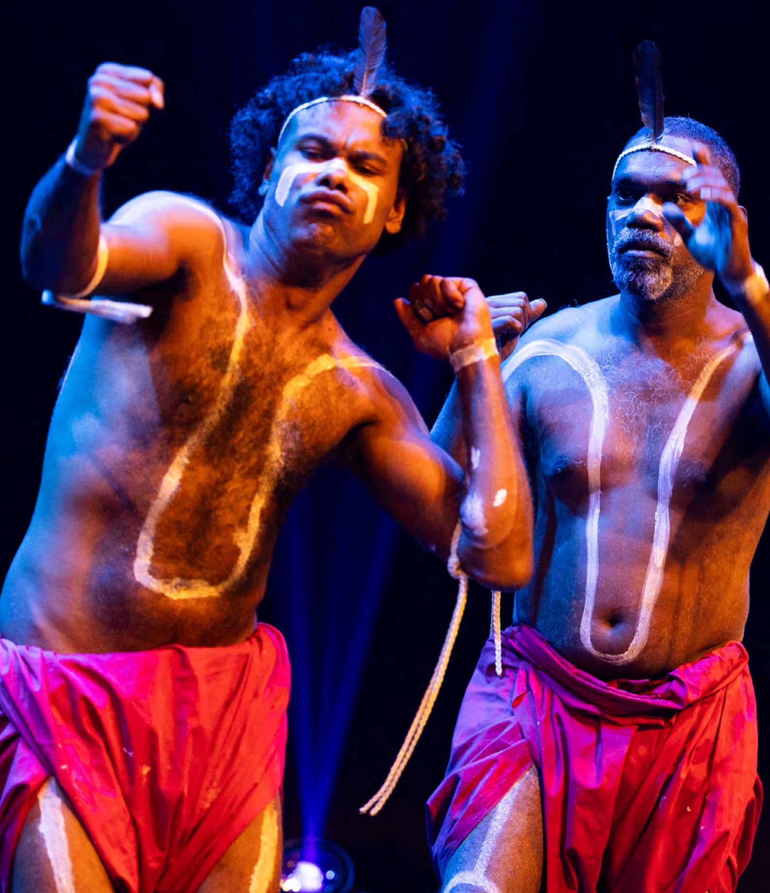
Pictured: Deaf Indigenous Dance Group (DIDG) performing at Undercover Artist Festival 2023