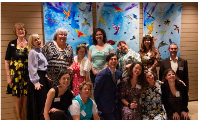
Pictured: Access Arts' exhibiting artists and staff at "Looking Back, Looking Forward" Exhibition (2022)

Our artists' second major exhibition called "Looking Back, Looking Forward" marked 10 years of Access Arts' partnership with KPMG. Over the decade, 42 artists have exhibited 225 artworks and reached an audience of 78,968 people. As a result of this partnership with KPMG, artists have sold 83 of their artworks over the years (37 per cent of works exhibited), which is a tribute to the standard, quality and creativity of their art.