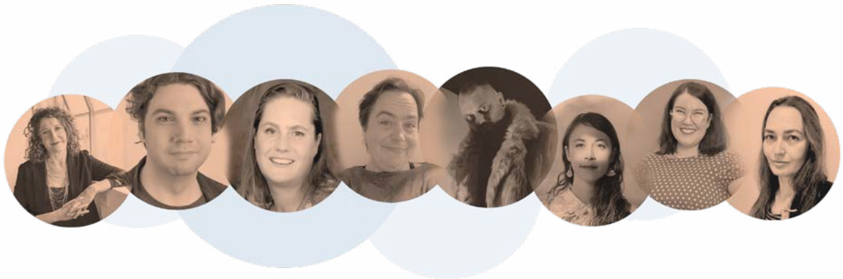
Pictured: Sync Leadership Australia Online 2022 Cohort

The disability-led Sync Leadership Australia Online Program built leadership skills in arts professionals with disability. For the second year, Access Arts - with funding support from the Australia Council for the Arts – collaborated with Sync UK to deliver this national program.