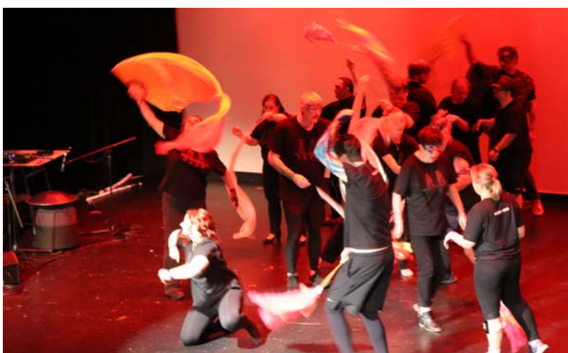
Access Arts' Light, Curtain, Action! participants performing "Otherwise"

However, the stand-out performance was by Access Arts' own participants.