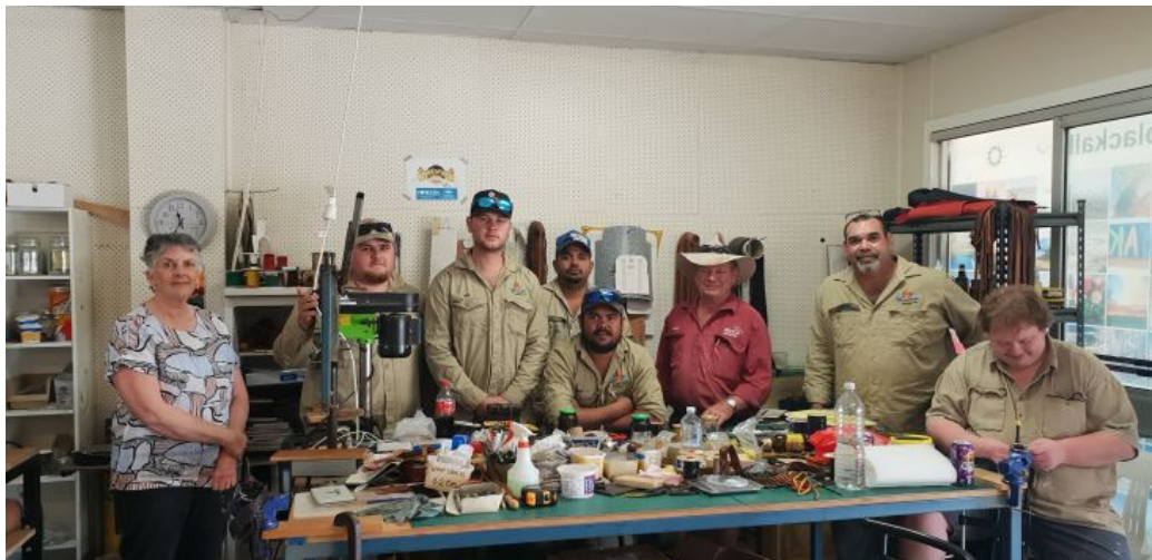
Barcaldine: Leather craft workshops brought together the men to learn bush craft skills

Culture, Family and Connection in Barcaldine, a series of community arts workshops engaging 15 First Australians over autumn and winter, culminated in a Reconciliation Gala Ball on 17 June 2022 attended by 180 people. This partnership with Red Ridge Interior and the Central West Aboriginal Corporation Barcaldine enabled First Nations artists along with the wider community to learn the process of print and design and create artwork to form prints for fabric. They then explored the concept of couture, and shared stories of culture, family and connection, as they created garments of 'wearable art' to dress in and model at a Gala Ball.