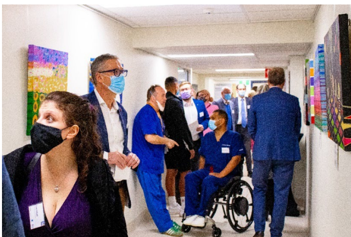
Dancing Colours private view, St Andrew's Hospital