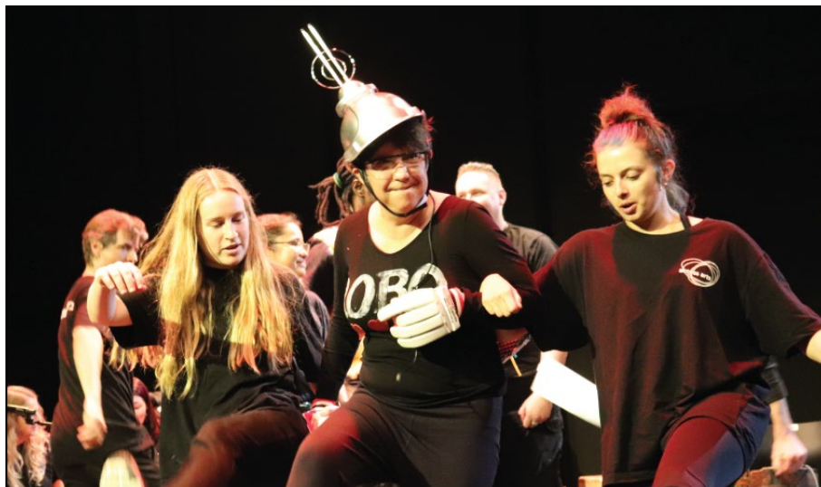
Access Arts' performing arts participants perform Three Worlds at Queensland Theatre

In September 2021 they performed at the prestigious Queensland Theatre on the Bille Brown stage. All three workshop disciplines – theatre and dance, Rhythm Circle and Access Arts Singers – worked together to create a new piece they called ‘3 Worlds’ for Undercover Artist Festival 2021.