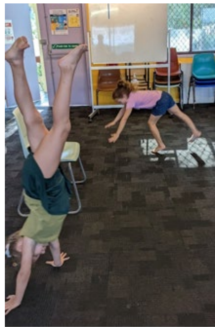
Belong, Acacia Ridge children