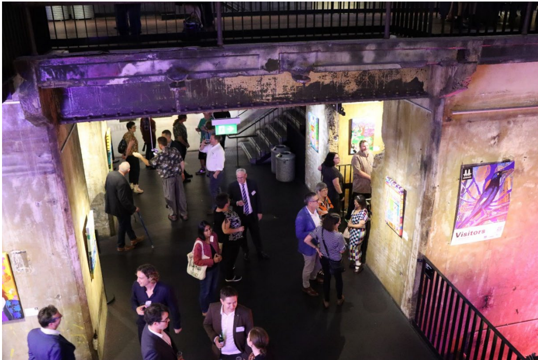
Private view of Visitors exhibition, Brisbane Powerhouse