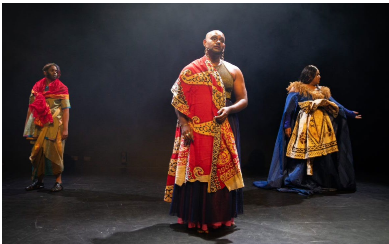
Brown Church, Undercover Artist Festival