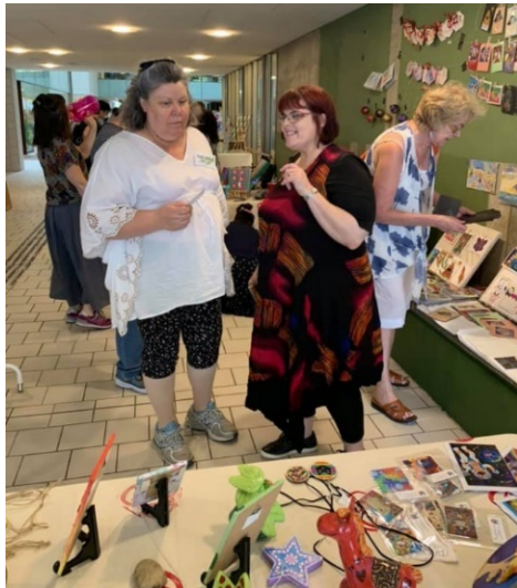
Access Arts artists at A Handmade Christmas Market, State Library of Queensland