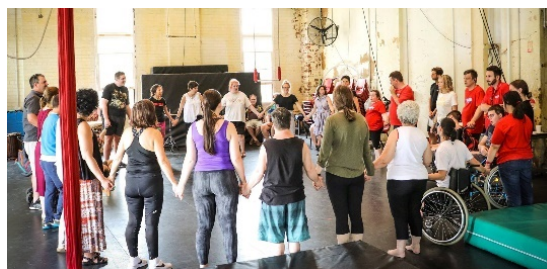
'Leaps and Bound's participants at Brisbane Powerhouse