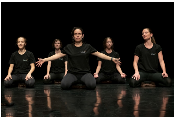
Karul Projects performing at the Judith Wright Centre of Contemporary Arts