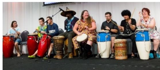
Rhythm Circle performing at Caring Fairly Carers Forum