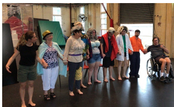
Taking a bow at Brisbane Powerhouse during Community Sharing Week