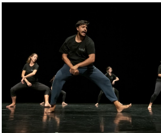
Karul Projects performing at the Judith Wright Centre of Contemporary Arts