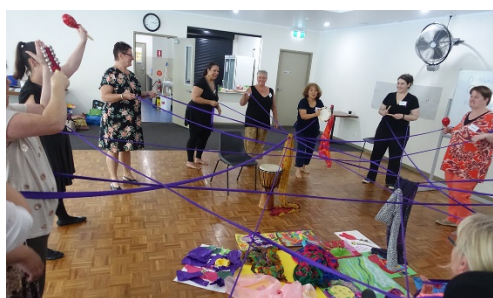
This is Where I Belong workshop participants