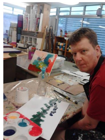
Explore Art Forms workshop Term 4.