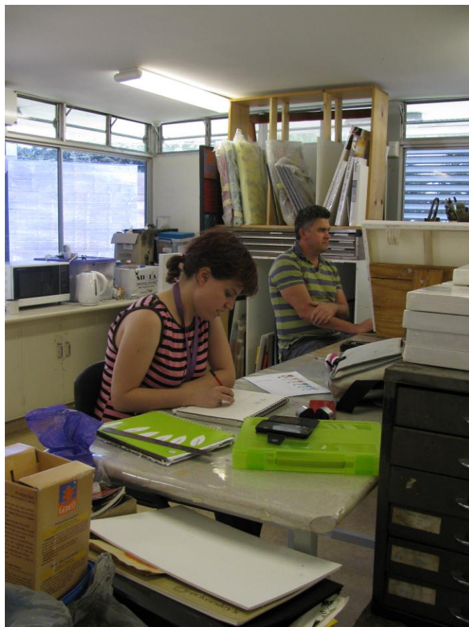
Brisbane Outsider Artists' Studio artists at work

The Brisbane Outsider Artists' Studio is for artists who want to develop their visual arts skills to a professional standard. BOA provides a self-directed learning environment in which artists are supported to reach their individual artistic goals. Artists receive professional development support, access to a variety of visual arts materials and opportunities to exhibit in quality exhibitions. The BOA studio is open on Mondays and Tuesdays from 10am – 3pm. Before attending the BOA studio in Brisbane, members are requested to make an appointment with Access Arts to present and discuss their arts practice.