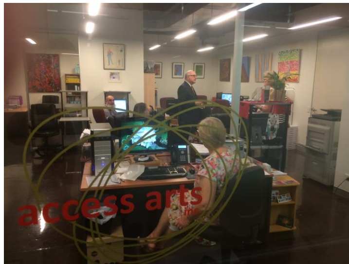
Senator Brandis on a visit to Access Arts' office