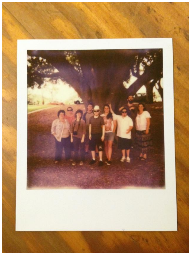
Camera Wonderers

The Access Arts Camera Wonderers are a group of dedicated photographers that meet once a week to discuss photography, techniques and ideas. The Camera Wonderers critique and encourage each other's developing photographic practice in a supportive, non-competitive environment. The Camera Wonderers facilitator fosters artistic development through: technical guidance, presenting the work of established photographers for inspiration, sharing exhibition opportunities, and encouraging the exploration of novel environments and subject matter.