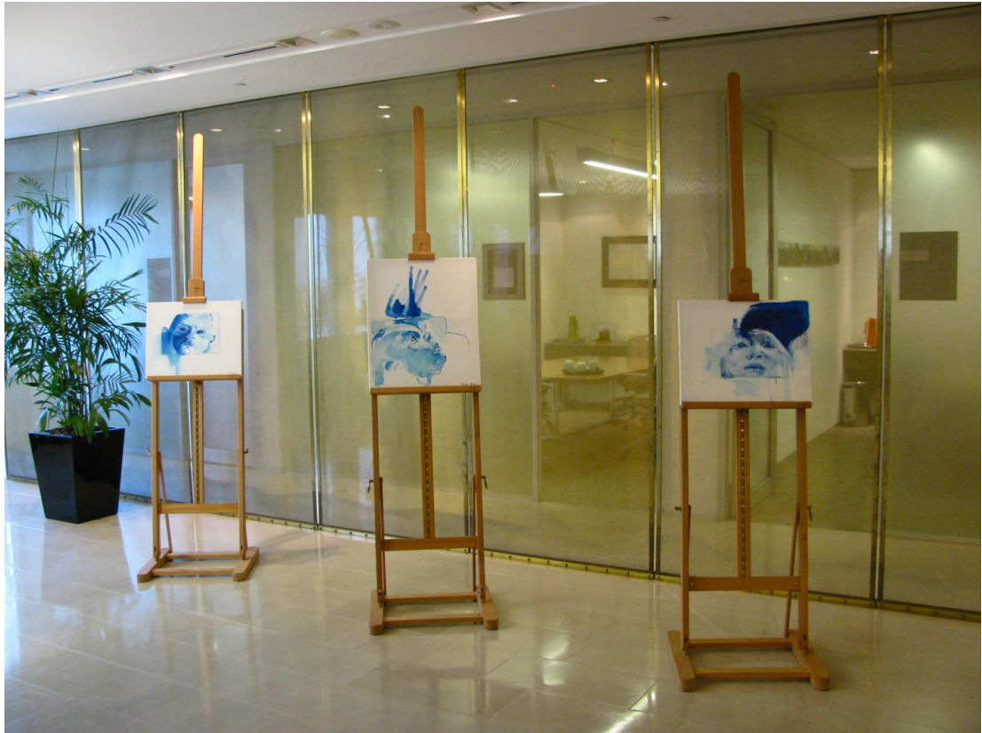
Artwork by Cybele Borel de Bitche exhibited at McCullough