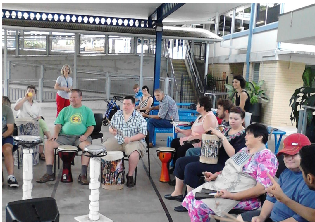
Drumming Workshop last term