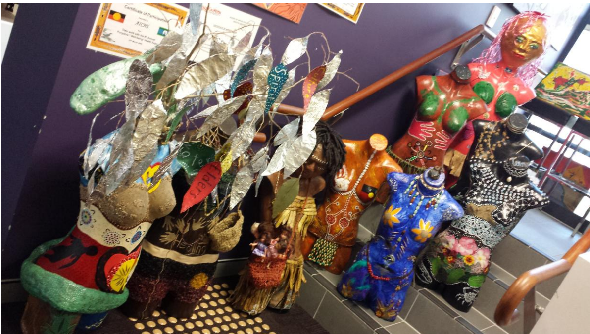
Torsos created as part of the Body Image Story project