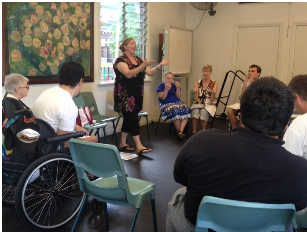
Singing Workshop last term