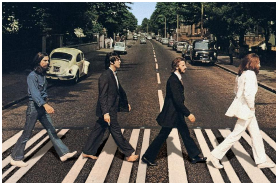
Abbey Road album cover by The Beatles

And with such incredible, clever, unique, original, intelligent, interesting, memorable recordings their success is easy to understand.