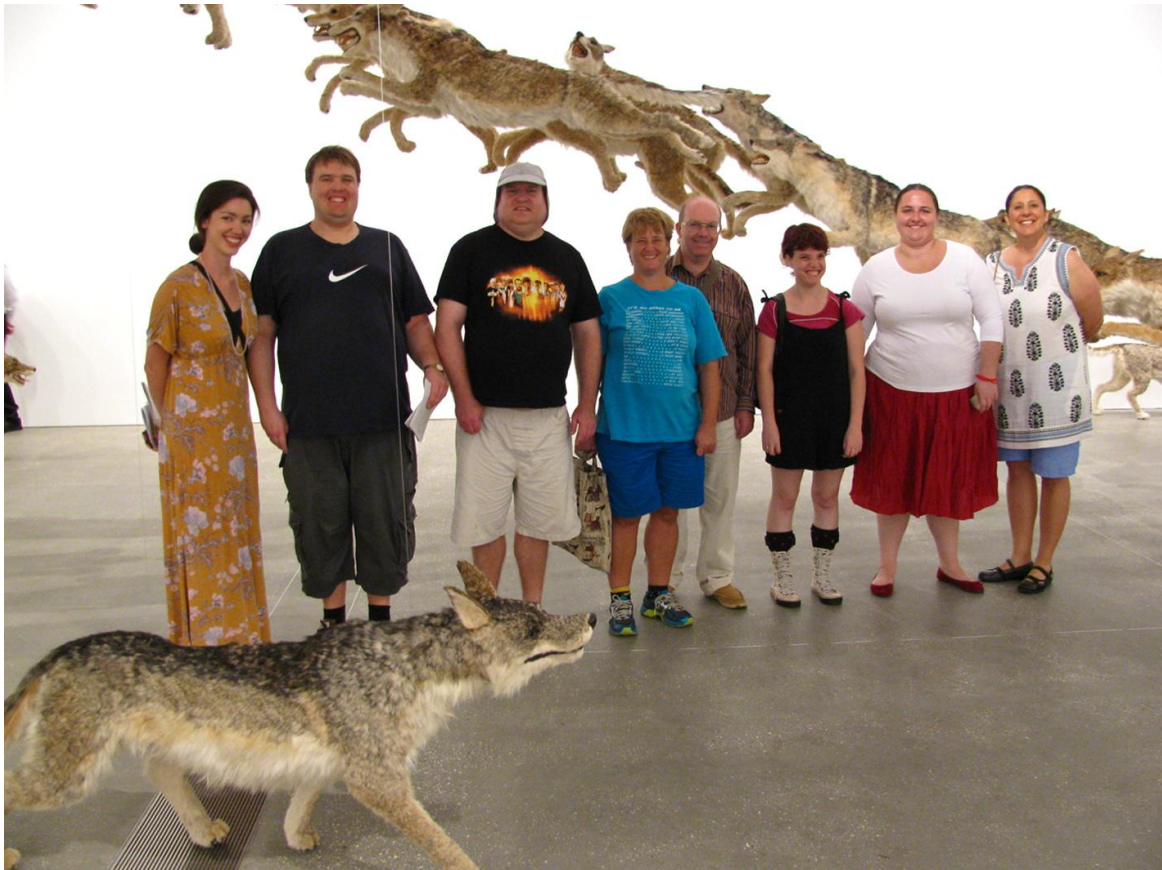
Members of Brisbane Outsider Artists' Studio at GoMA

This term members of the Brisbane Outsider Artists' Studio went to the Queensland Art Gallery and the Gallery of Modern Art to gain inspiration for their own creative practices. The primary exhibition on display was titled Falling Back to Earth ; a large scale series of four dramatic installations by one of the world's leading artists, Cai Guo-Qiang. The members also viewed a range of smaller exhibitions including Voice and Reason , Seen and Heard , Ring of Stones and Transparent: Watercolour in Queensland 1850s – 1980s . It was a great day!