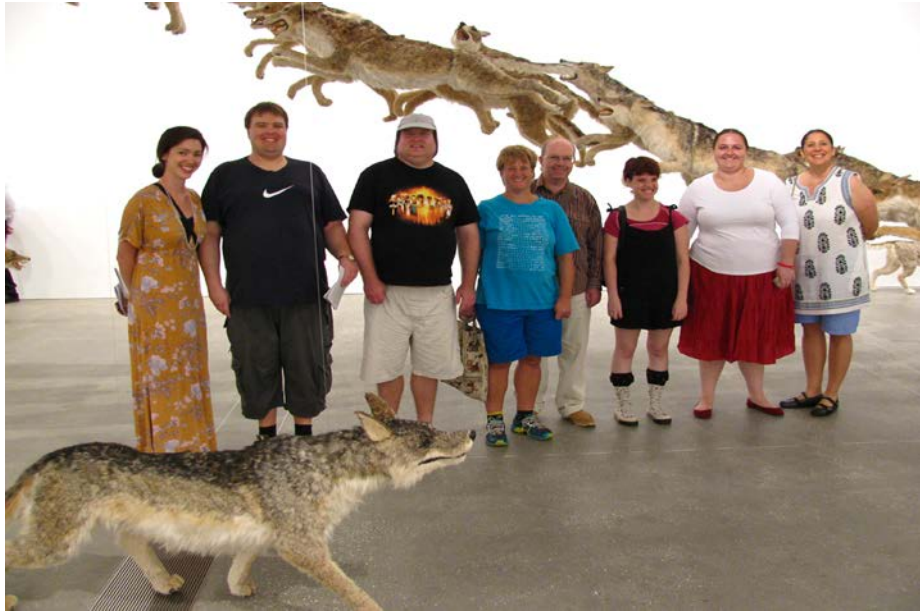
Members of Brisbane Outsider Artists' Studio on a gallery visit to Falling Back to Earth by Cai Guo-Qiang at GOMA