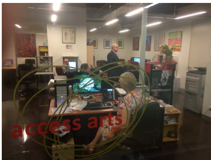
Commonwealth Attorney-General and Minister for the Arts, Senator the Hon George Brandis QC visiting the Access Arts office

Access Arts undertook an Access Appraisal of the 2014 Brisbane Writers Festival last September. In response to our appraisal report they wrote to us: 'Thank you very much to your team for putting together such a comprehensive report for us. I know I speak for all here when I say that we have gained many helpful insights from your appraisal and are looking forward to developing our policies and procedures further'.