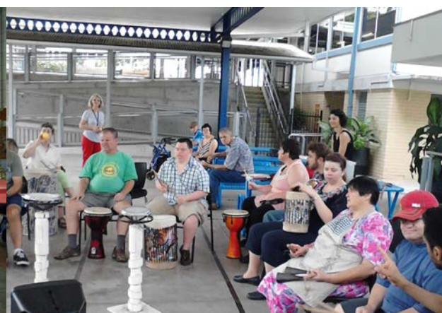
Drumming Workshop, June 2014