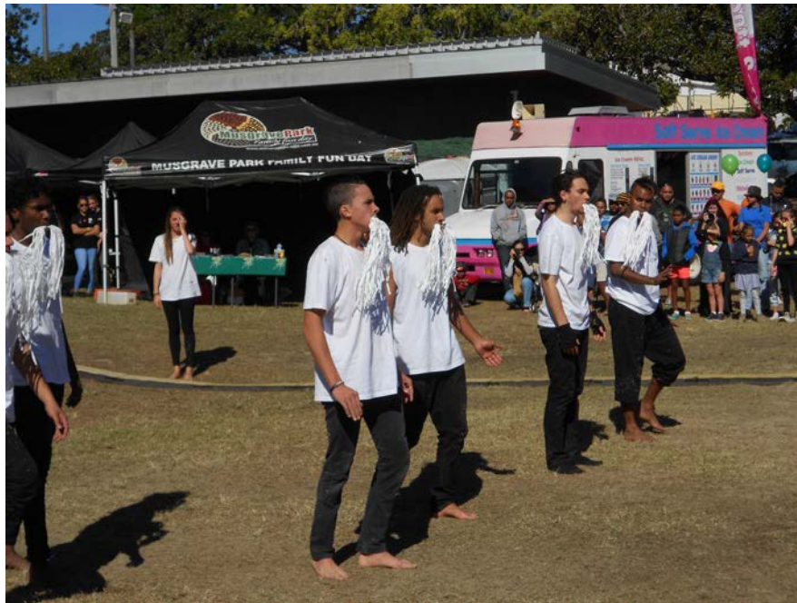
NAIDOC July 2014

We worked with Inala Wangarra on a Rite of Passage Ball for young school leavers. Celebrating NAIDOC was a partnership with the Aboriginal Centre for Performing Arts.