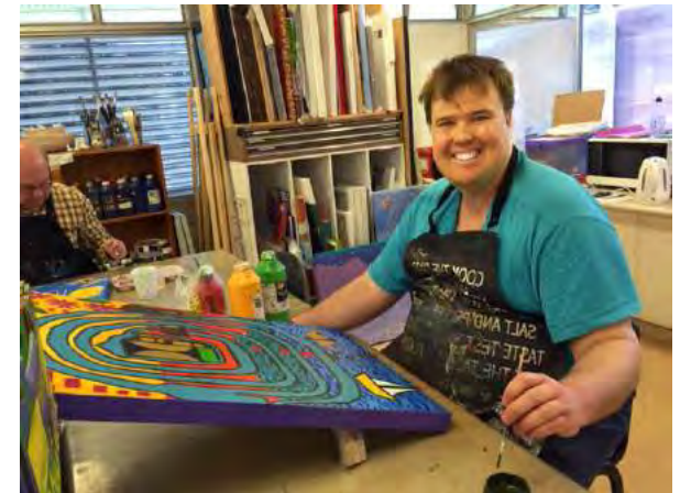
Visual Arts Workshops at EIGHT MILE PLAINS