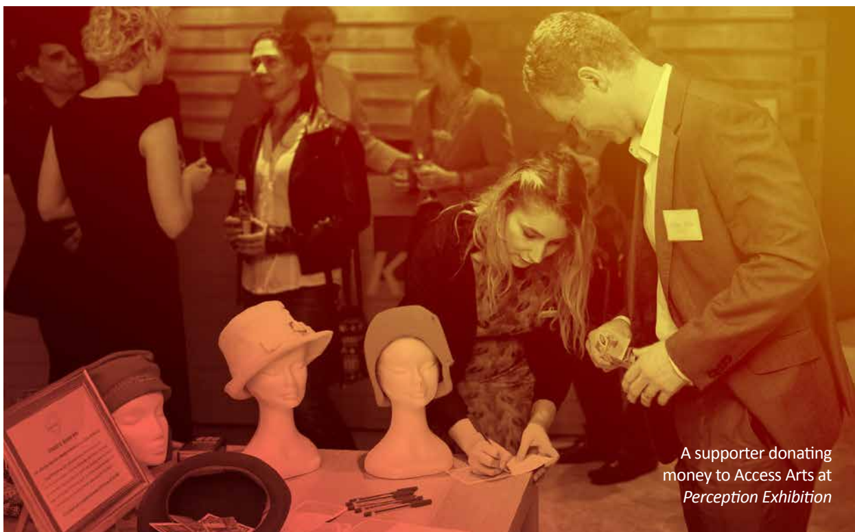
A supporter donating money to Access Arts at Perception Exhibition

To donate today, please visit http://accessarts.org.au/get-involved/donate/