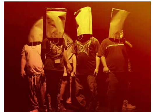
The Second Echo Ensemble perform The Rite of Spring