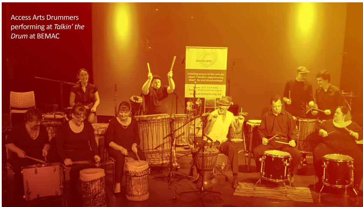
Access Arts Drummers performing at Talkin' the Drum at BEMAC