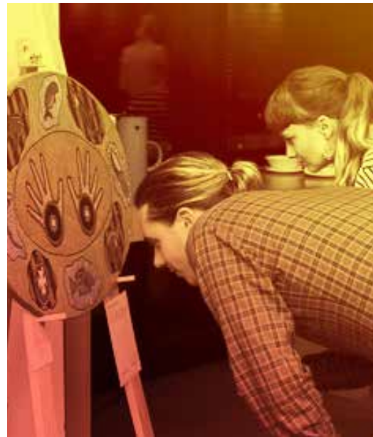
Paintings captivate the audience.

The Honourable Coralee O'Rourke MP, Minister for Disability Services, Minister for Seniors and Minister Assisting the Premier on North Queensland