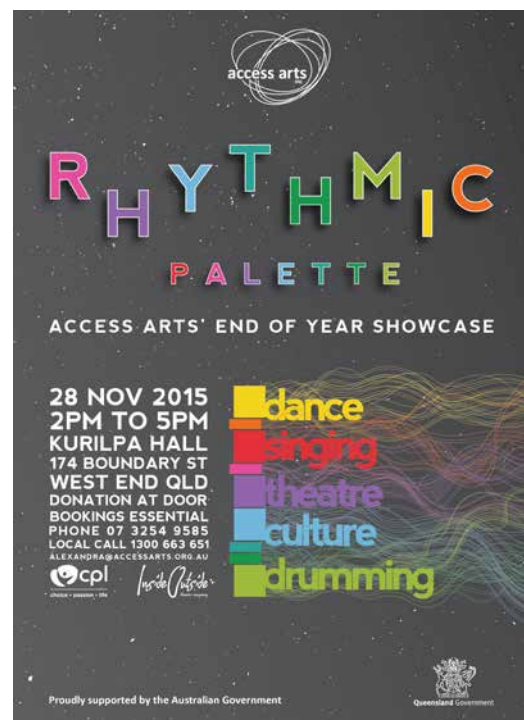
Rhythmic Palette Poster