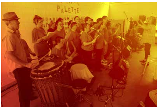
Access Arts Singers and Drummers performing.

“ Keep up the terrific work and all the best for 2016 ”