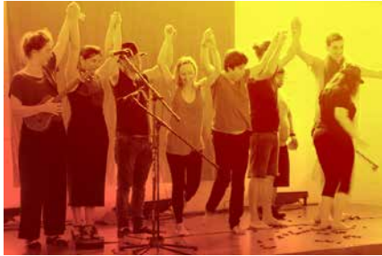
Theatre Ensemble at the end of their group performance.