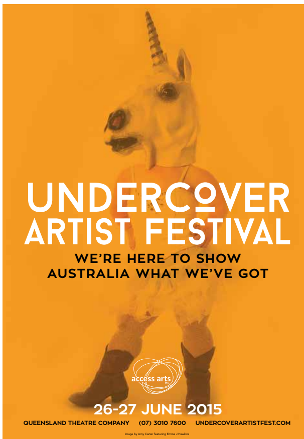
Undercover Artist Festival Poster