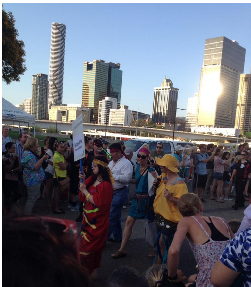
Movers and Shakers at Brisbane on Parade

Above is a picture I took from the end of the parade route at South Bank.