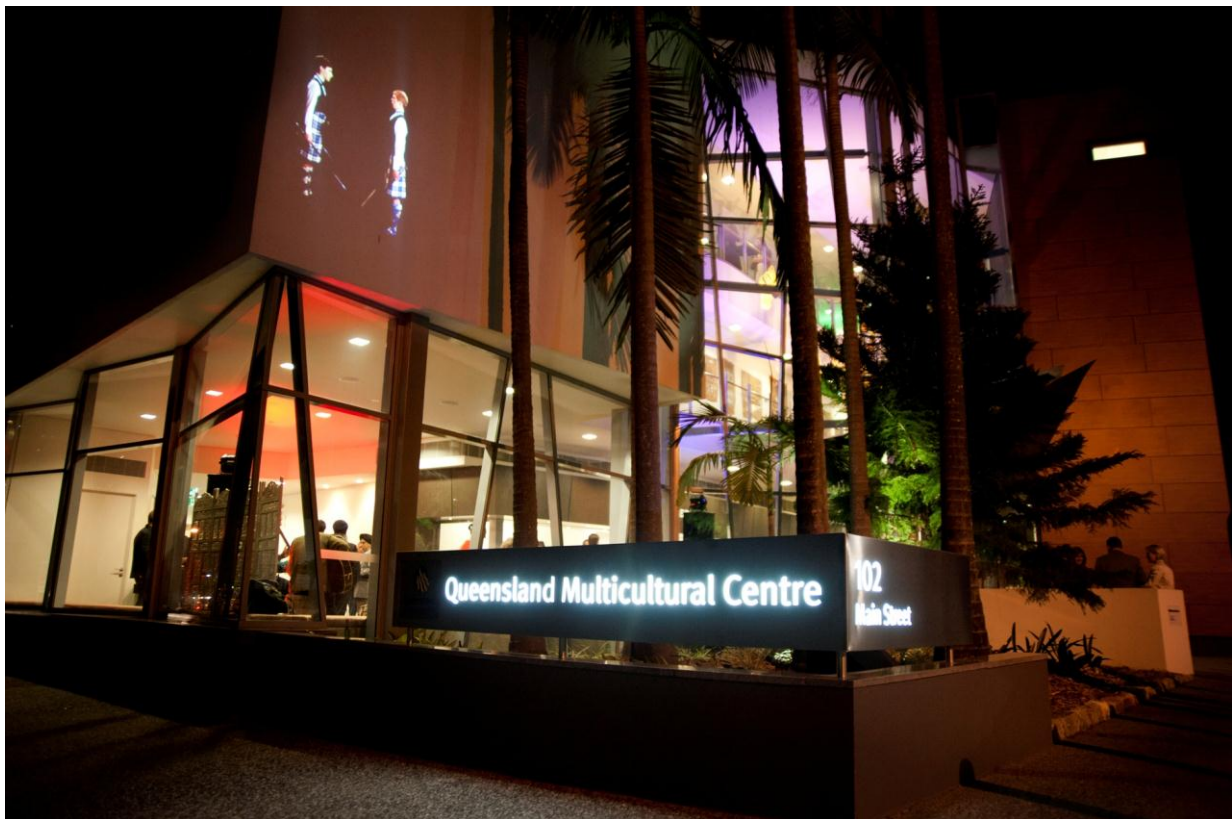
Queensland Multicultural Centre – venue for the community showcase

RSVP: info@accessarts.org.au or phone 07 3254 9585, local call 1300 663 651, by Wednesday 26th November