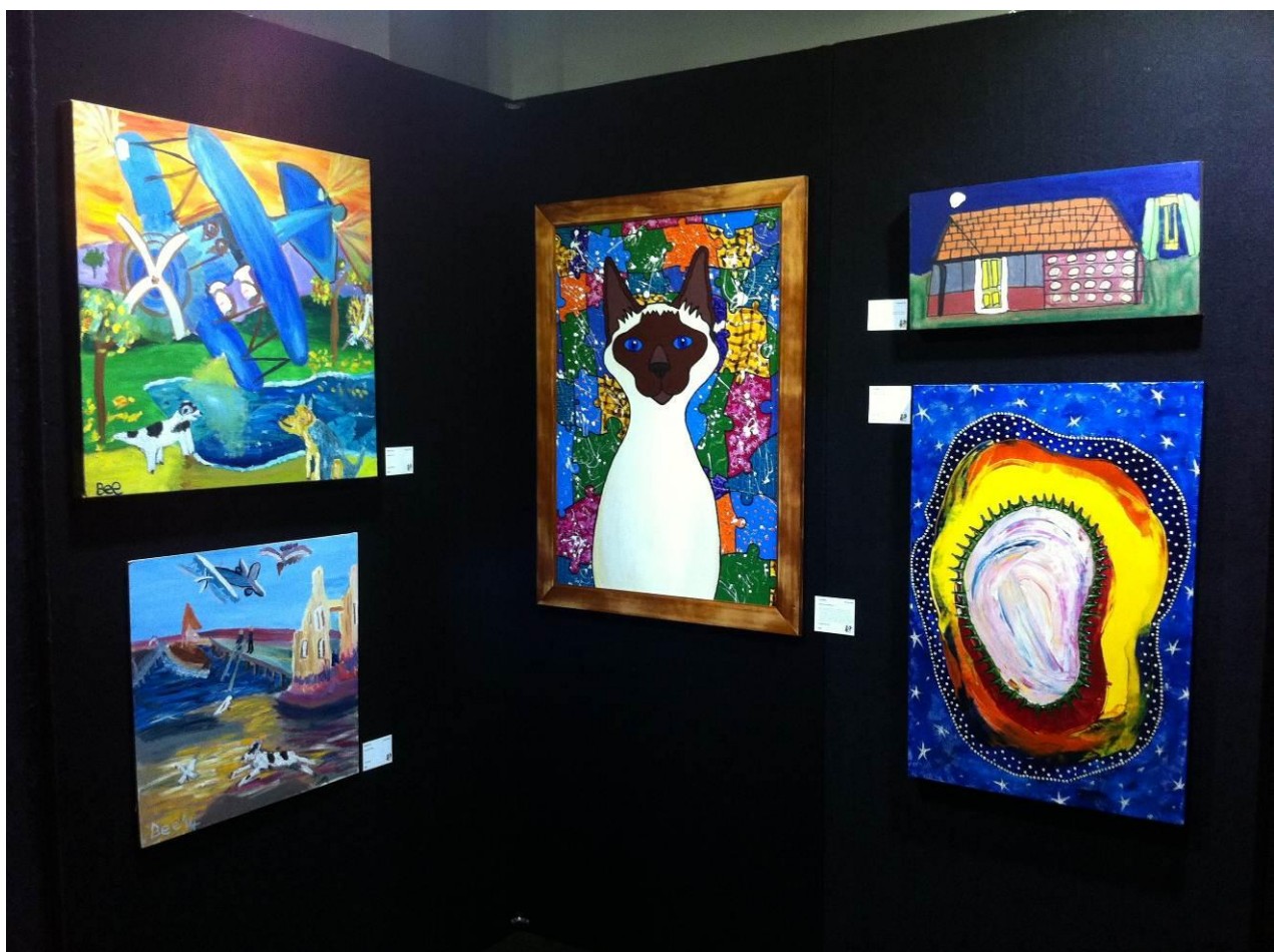
Display of works by artists from Access Arts at Art from the Margins Exhibition

This year our members sold a total of 11 artworks. Congratulations to all the artists who participated in this exhibition!