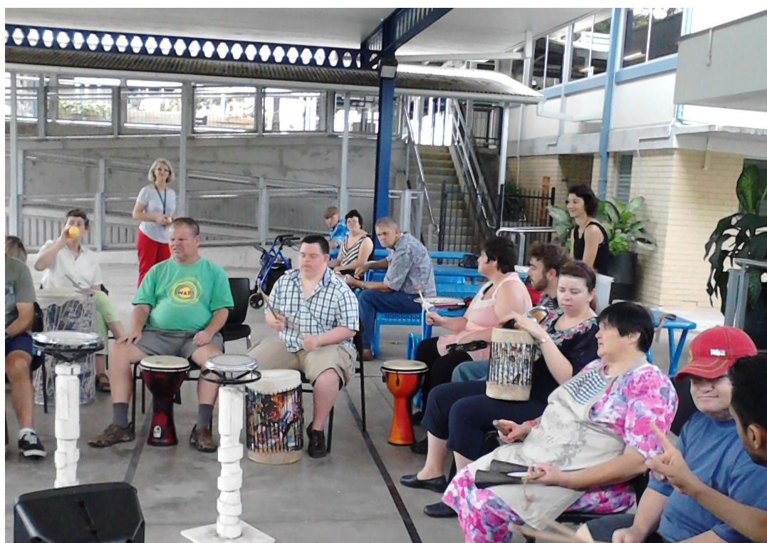
Drumming Workshop earlier this year