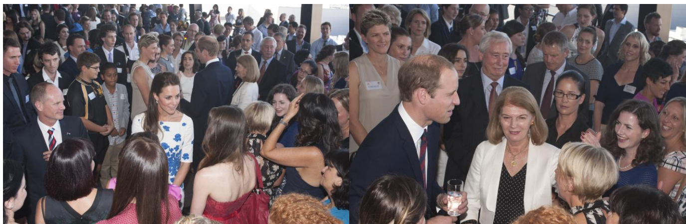
State Reception in Brisbane for their Royal Highnesses the Duke and Duchess of Cambridge