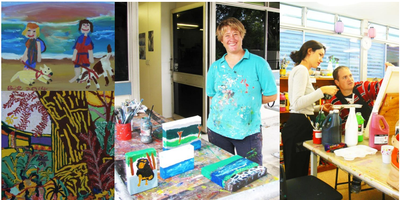
Top left: artwork by Belinda Peel

BOA members are currently preparing small scale artworks for Access Arts' market stall at Government House Open Day on 8 June and the Teneriffe Festival on 5 July. There will be a range of small paintings, jewellery and postcards for sale, as well as live art!