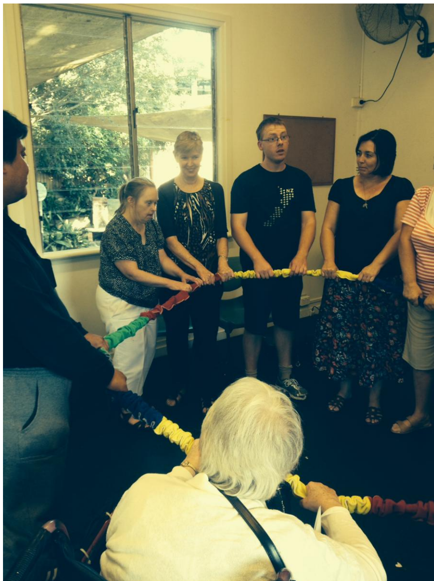
Singing Workshop last term