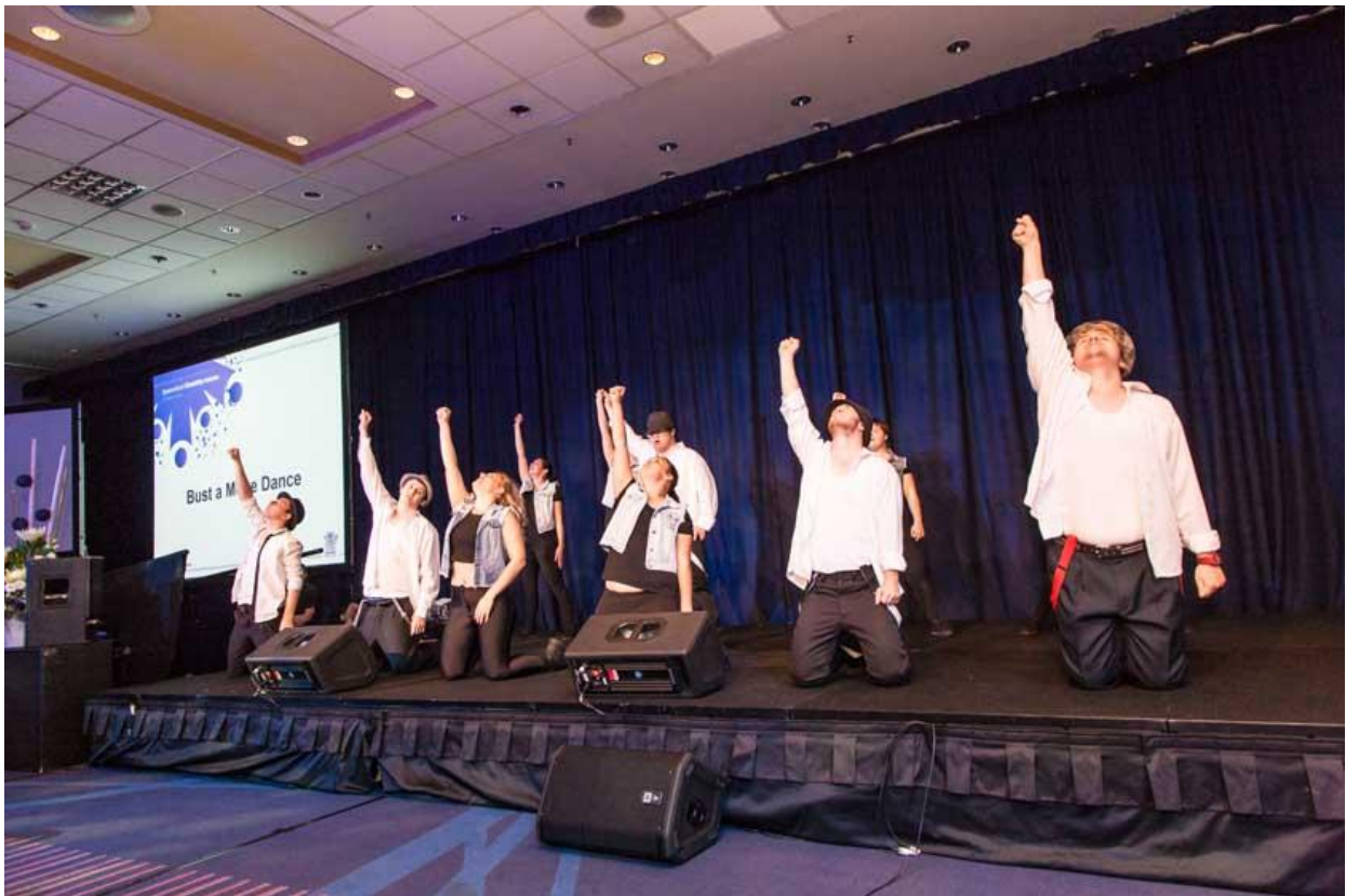
Bust A Move dancers