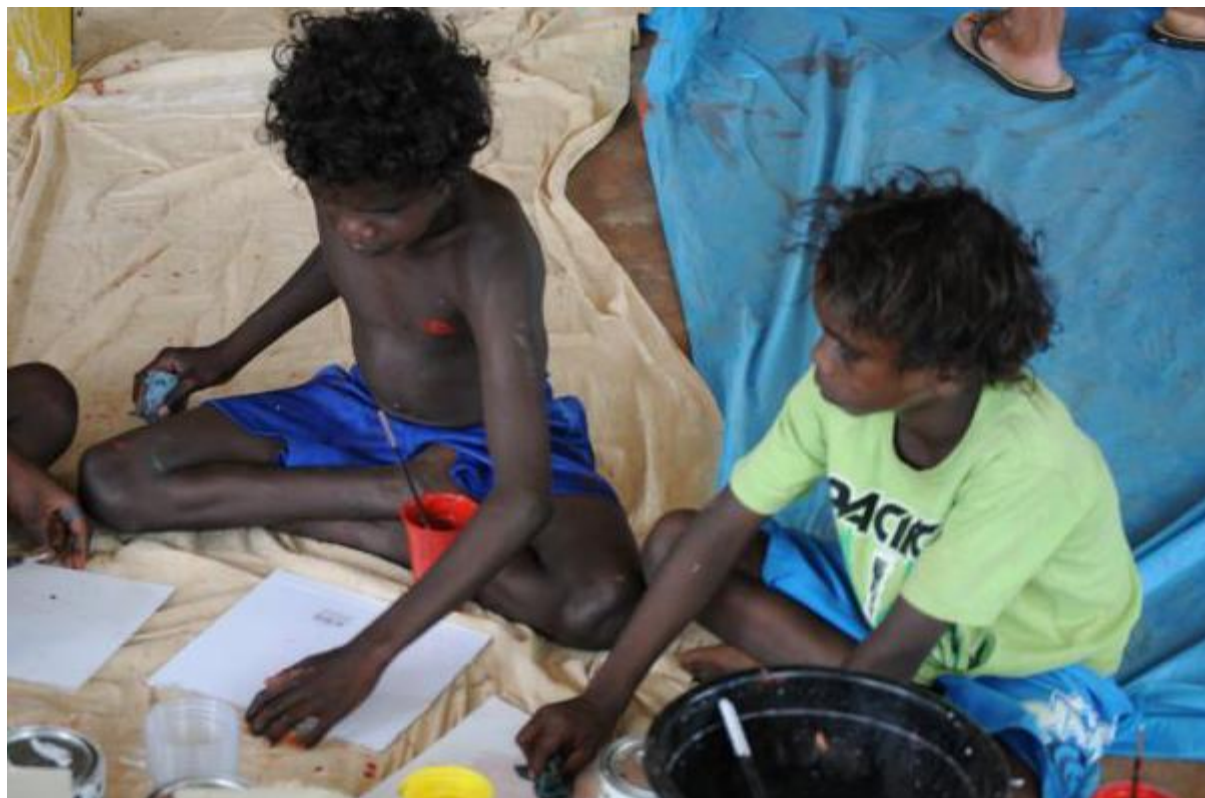
Participants preparing designs for Creative Recovery to Creative Livelihoods in Aurukun, 2009

taken part in producing a tremendous legacy of work, for example From Creative Recovery to Creative Livelihoods in Far North Queensland in cooperation with the Australasian Centre for Rural and Remote Mental Health.