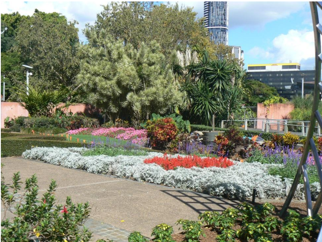
Top Left: Michael Mulvey drawing at Roma St Gardens