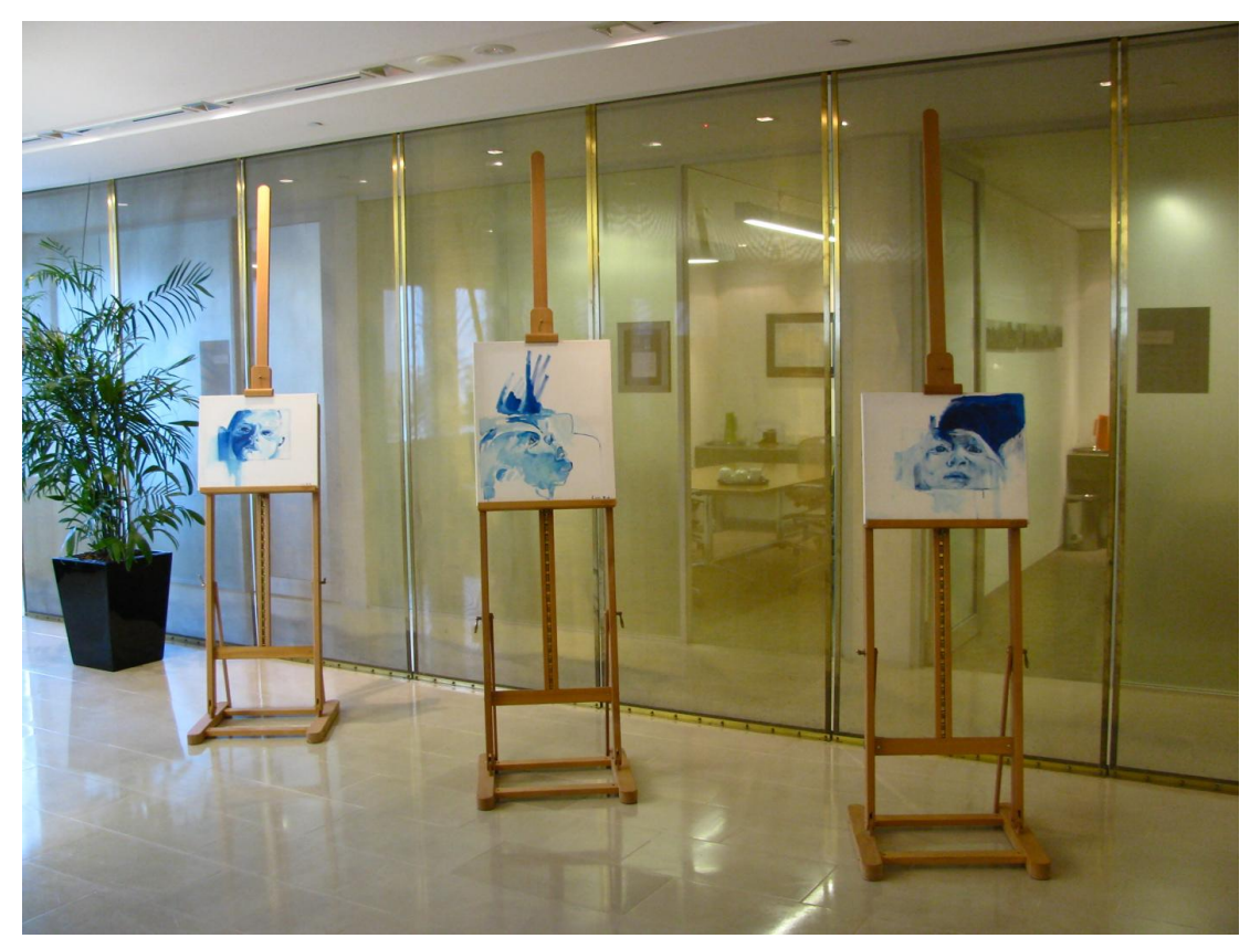
Artwork by Cybele Borel de Bitche exhibited at McCullough