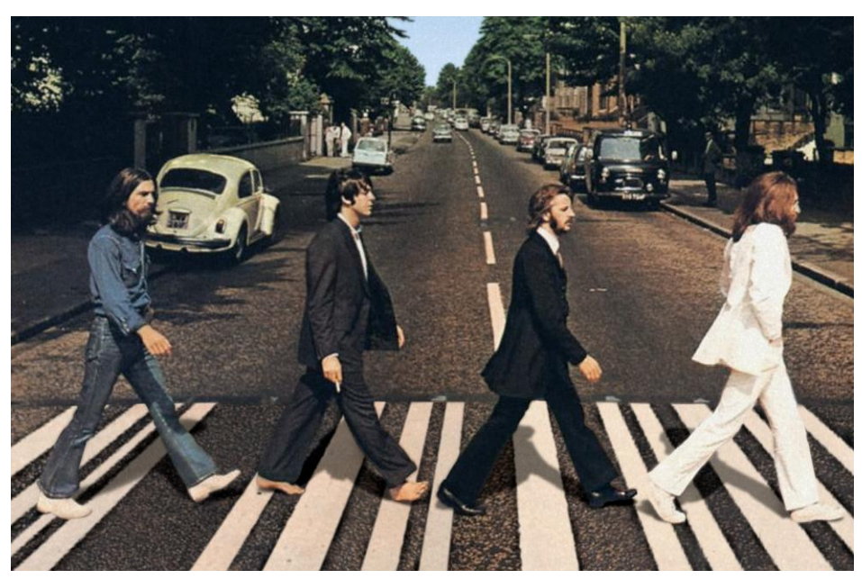
Abbey Road album cover by The Beatles

And with such incredible, clever, unique, original, intelligent, interesting, memorable recordings their success is easy to understand.